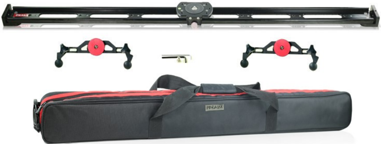
4ft Zeal slider with End Feet

Please inspect the contents of your shipped package to ensure you have received all that is pictured and listed below.