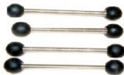
4 x Leveling feet