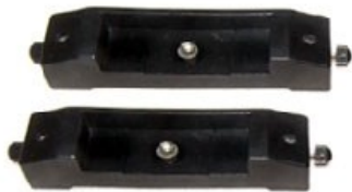
2 - End Stops